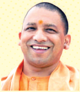
Shri Yogi Adityanath Chief Minister, U.P.