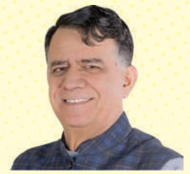
Shri Satish Mahana Minister of Industrial Development, U.P.